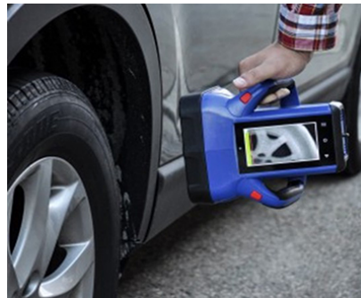
Portable X-ray backscatter imaging

The security market demands solutions that can see through a variety of objects, including backpacks, car seats, tires, and exterior metal panels. Seeing through thick objects or objects made of heavy elements such as iron by X-ray backscattering requires an X-ray source that can emit higher energy X-rays. In order to emit high-energy X-rays, the X-ray source must operate at a high voltage, but using a high-voltage X-ray source tends to make the device larger and more cumbersome. Having a small, lightweight, portable X-ray source can greatly reduce restrictions on the range of locations where inspections can be conducted. The Mox140G has a major advantage in the security market because it is portable in size and weight, yet can operate at a high voltage of 140kV.