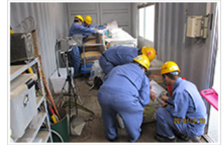
Scenes from a reporting drill