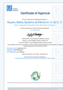
IATF 16949 Certificate

※ LRQA—third certification party for IATF certificate.