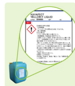
Sample GHS-compliant label