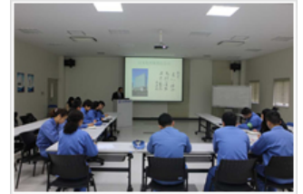
Training at a Group company in China

The Nippon Kayaku Group provides training and calls on each workplace to establish an action plan in order to instill and foster greater awareness of compliance among its employees. In turn, specific compliance related activities are carried out at each workplace. The results of these activities carried out throughout each fiscal year are evaluated and then utilized in continuous efforts to educate employees about the importance of compliance.