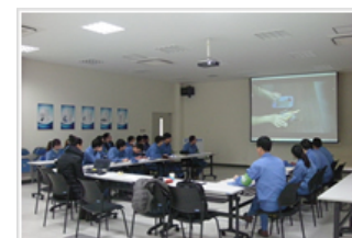
Training on the 5S methodology (Sort, Systematize, Shine, Standardize and Self-Discipline)