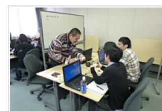
Training on quality