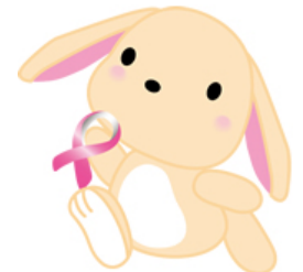
Kayami – the Nippon Kayaku Pink Ribbon campaign character