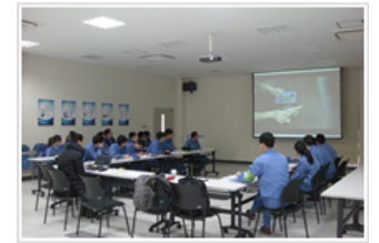
Training on the 5S methodology (Sort, Systematize, Shine, Standardize and Self-Discipline)