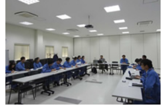
ISO audit in progress