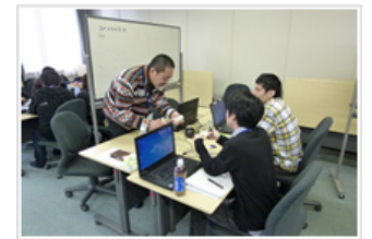
Training on quality