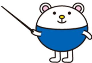
Kayakuma the Bear mascot character representing KAYAKU spirit

We have created a mascot character called Kayakuma the Bear in order to make KAYAKU spirit a concept that is more familiar to all Nippon Kayaku Group employees around the world. This character appears in part of the company newsletter that introduces CSR activities and activities for implementing the corporate vision using visual depictions that are easier to understand for all audiences. The mascot has also been incorporated into our daily stationery, clear file folders and even the designs of conference rooms. This ensures employees are always aware of Kayakuma the Bear and in touch with our corporate vision in all aspects of their work. We are currently filing for a trademark for Kayakuma the Bear and plan on widely using it as a symbol of the Nippon Kayaku Group in newspaper ads and novelty items and events, such as factory festivals.