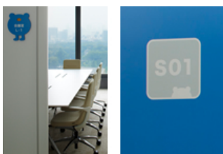
Conference room and employee locker

We have created a mascot character called Kayakuma the Bear in order to make KAYAKU spirit a concept that is more familiar to all Nippon Kayaku Group employees around the world. This character appears in part of the company newsletter that introduces CSR activities and activities for implementing the corporate vision using visual depictions that are easier to understand for all audiences. The mascot has also been incorporated into our daily stationery, clear file folders and even the designs of conference rooms. This ensures employees are always aware of Kayakuma the Bear and in touch with our corporate vision in all aspects of their work. We are currently filing for a trademark for Kayakuma the Bear and plan on widely using it as a symbol of the Nippon Kayaku Group in newspaper ads and novelty items and events, such as factory festivals.