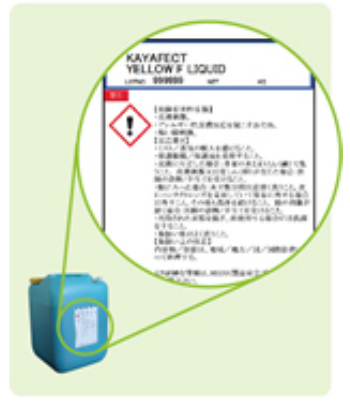
Sample GHS-compliant label