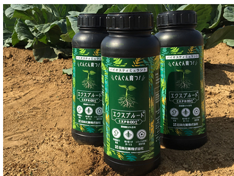
Our Biostimulant items

Biostimulants act upon on plant physiology along a different path to nutrients, as agricultural materials that enhance plants' resistance to "abiotic stresses" such as drought, cold weather, salinization and physical damage (hail and wind damage), improving yields and quality as a result. Seaweed extract, amino acid materials and humic acid are some specific examples of Biostimulants. These materials are expected to have effects such as promoting the nutrient absorption, activating photosynthesis or accelerating flowering and fruit setting. In the Agrochemicals Business, we believe that our expertise in evaluation and formulation technologies will maximize the efficacy of Biostimulants, aiding in the further progress and widespread adoption of Biostimulant materials.