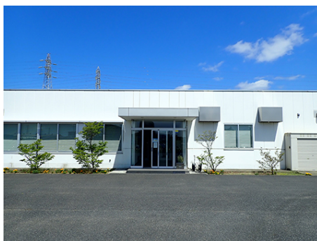
The plants to the left of the entrance have been treated with Biostimulant materials. The plants on the right are untreated.