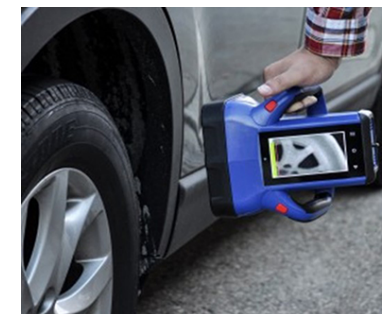
Portable X-ray backscatter imaging * Image used courtesy of Viken Detection.

The security market demands solutions that can see through a variety of objects, including backpacks, car seats, tires, and exterior metal panels. Seeing through thick objects or objects made of heavy elements such as iron by X-ray backscattering requires an X-ray source that can emit higher energy X-rays. In order to emit high-energy X-rays, the X-ray source must operate at a high voltage, but using a high-voltage X-ray source tends to make the device larger and more cumbersome. Having a small, lightweight, portable X-ray source can greatly reduce restrictions on the range of locations where inspections can be conducted. The Mox140G has a major advantage in the security market because it is portable in size and weight, yet can operate at a high voltage of 140kV.