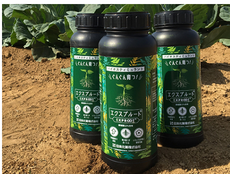
Our Biostimulant items

Biostimulants act upon on plant physiology along a different path to nutrients, as agricultural materials that enhance plants' resistance to "abiotic stresses" such as drought, cold weather, salinization and physical damage (hail and wind damage), improving yields and quality as a result. Seaweed extract, amino acid materials and humic acid are some specific examples of Biostimulants. These materials are expected to have effects such as promoting the nutrient absorption, activating photosynthesis or accelerating flowering and fruit setting. In the Agrochemicals Business, we believe that our expertise in evaluation and formulation technologies will maximize the efficacy of Biostimulants, aiding in the further progress and widespread adoption of Biostimulant materials.