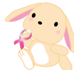
Kayami – the Nippon Kayaku Pink Ribbon campaign character