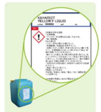
Sample GHS-compliant label