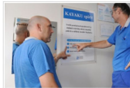
Corporate vision board at INDET SAFETY SYSTEMS a.s. in the Czech Republic

Beginning in 2009, we launched an organization-wide internal project aimed for strengthening our CSR promotion structure that has enabled us to promote company-wide initiatives. We also hold dozens of CSR and compliance training sessions throughout the year in order to spread our corporate vision and CSR-focused mindsets to all of our employees. We have also translated the KAYAKU spirit as well as pamphlets and portable cards on our form of CSR management into six languages that are in turn shared across the entire Nippon Kayaku Group. In fiscal 2012, we prepared poster boards on the KAYAKU spirit and Group Action Guidelines in each local language and displayed them at all of our workplaces around the world.