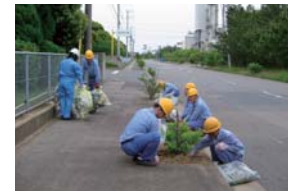
Clean-up activities (Kashima plant)