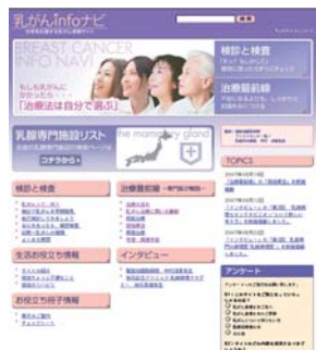
Breast Cancer Info Navi http://www.nyugan-infonavi.jp/n_navi/

In order to provide information that will improve the quality of health care and promote the correct use of our company's products, Nippon Kayaku provides support for study meetings for health care professionals concerning image diagnosis (such as mammography and ultrasound) and treatment of breast cancer. So that ordinary persons also have a correct understanding of breast cancer, we also have joined the Pink Ribbon Campaign and help sponsor the "Breast Cancer Info Navi" website that provides information about breast cancer.