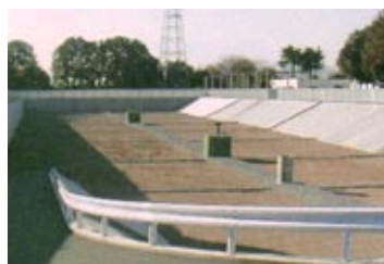
The ultimate disposal facility of controlled type

Nippon Kayaku takes a variety of actions to control the final amount of disposed waste materials. The Company